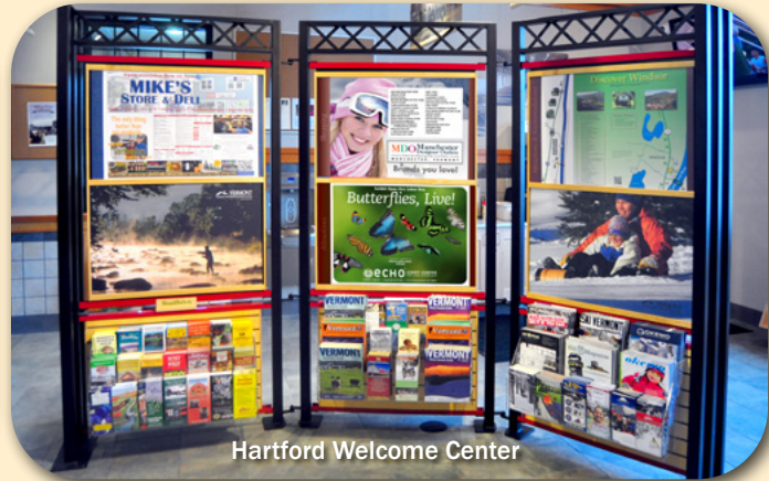
Hartford Welcome Center