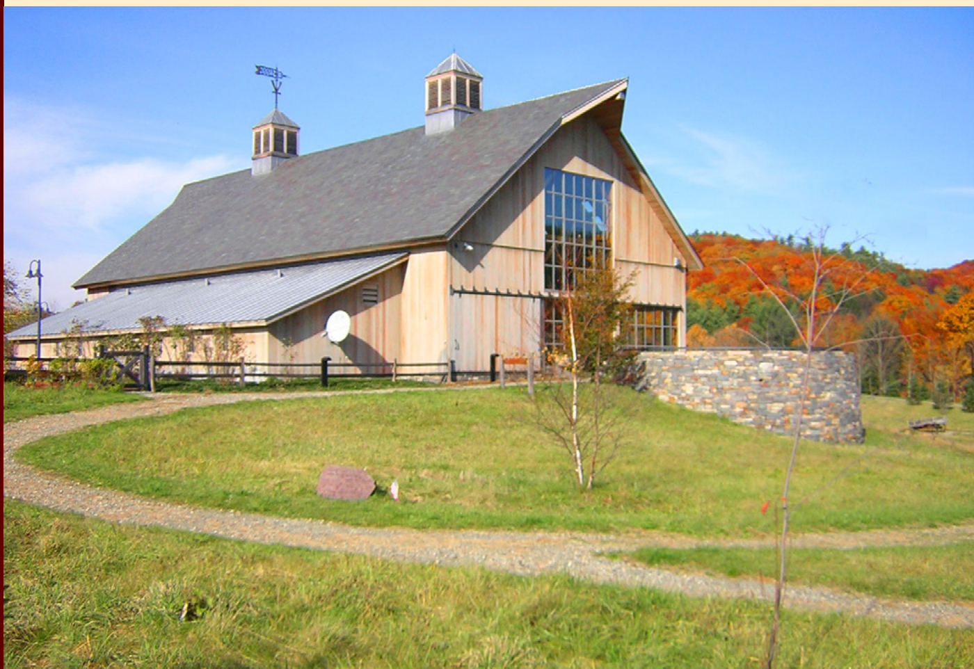
Guilford Welcome Center