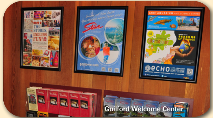
Guilford Welcome Center