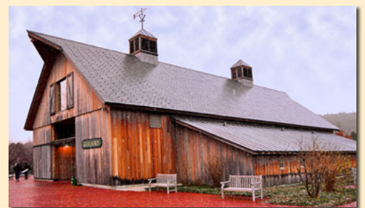
Guilford Welcome Center