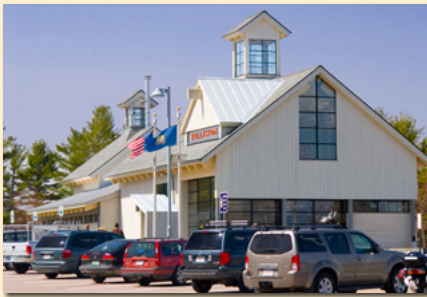
Williston North Information Center

T he Vermont Information Center Division provides an excellent opportunity to capture the attention of over four million travelers who pass through our 18 centers statewide. Our centers provide you with a direct link to the traveling public, offering exposure for your products or services.