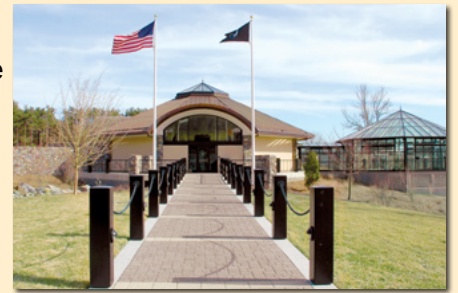
Sharon Welcome Center

T he Vermont Information Center Division provides an excellent opportunity to capture the attention of over four million travelers who pass through our 18 centers statewide. Our centers provide you with a direct link to the traveling public, offering exposure for your products or services.