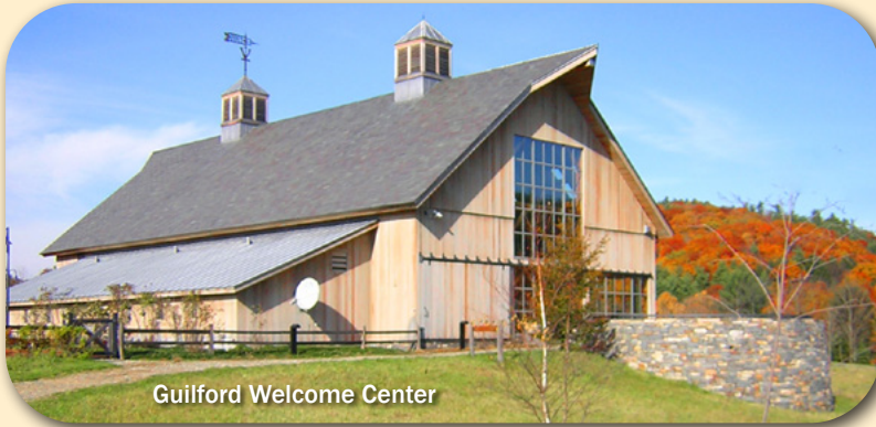
Guilford Welcome Center

In addition to the brochure display space, static wall ads are also available in the seven centers listed below. (See Print Media Rates Table). For more information please call Lisa Sanchez at 802-793-9918.