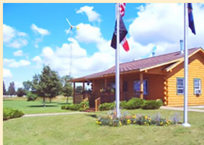
Alburgh Welcome Center Open May through October