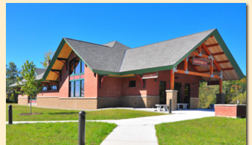
Hartford Welcome Center