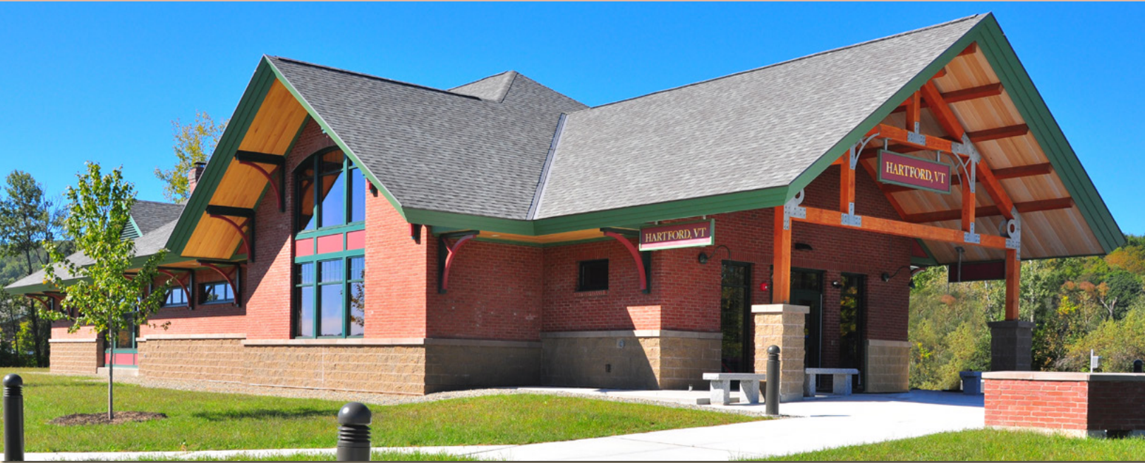
Hartford Welcome Center