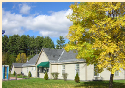
Waterford Welcome Center