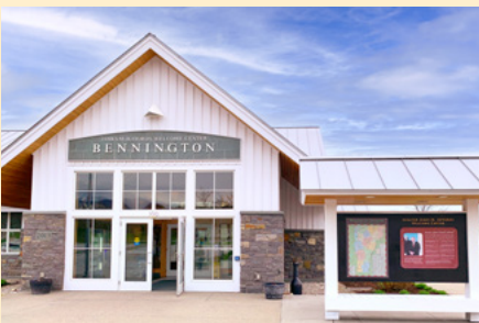
Bennington Welcome Center