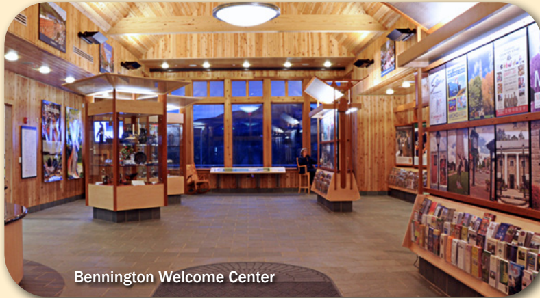
Bennington Welcome Center