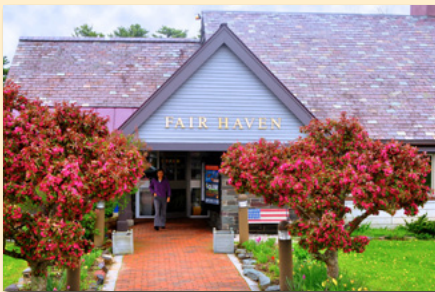
Fair Haven Welcome Center